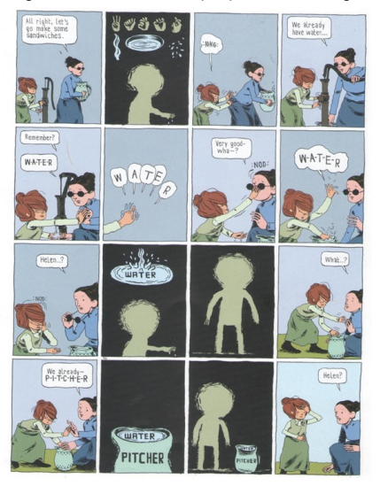
Fig. 2. Lambert, Joseph. Annie Sullivan and the Trials of Helen Keller (2012), Disney Hyperion, New York

Lambert has employed a tight and close 4 x 4 grid on nearly every page. He requisitely collapsed a couple of panels on the same page as a point of emphasis and preferred even larger panels preferably to express when something is emotional and normatively powerful stroke has occurred, for instance when Helen was able to spell out the word "water" for the first time. Lambert made use of his panels very closely to seamlessly feature upon it without missing the point of reference here. In the case of engaging with tiny panels, he kept his figures very simple and used a thin and delicate line to make them appropriate to the panels to maintain his narrative sequence. He was drifting loosely towards a more cartoony style which permitted him to use all sorts of shortcuts like dark scribbles over the head of the characters to indicate their anger and a scribble line on a face for anger as to be done in proper cartooning.